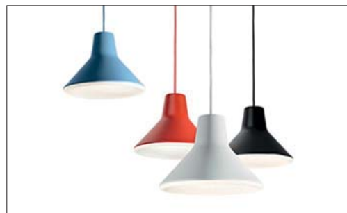
D68 - screw connection E27

Suspension accessory D68s/5(l 5 m) 1D680S50002 white 1D680S50001 black 1D680S50023 light blue 1D680S50007 red